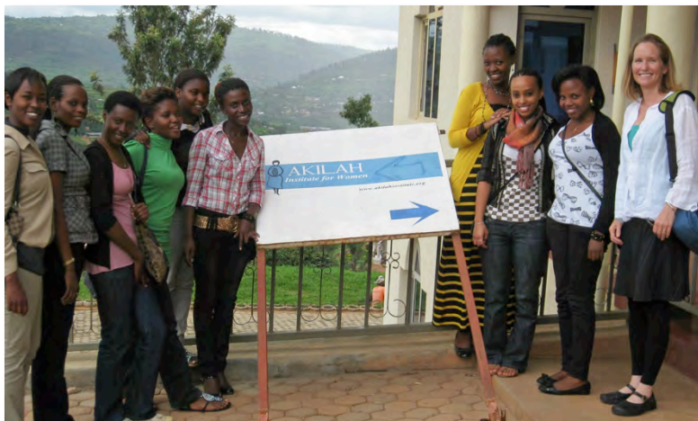
AI Entrepreneurship Students, May 2013